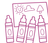
Colouring In Competition