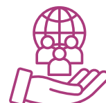
Kindness for a Cause