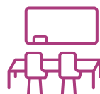
Class room comp